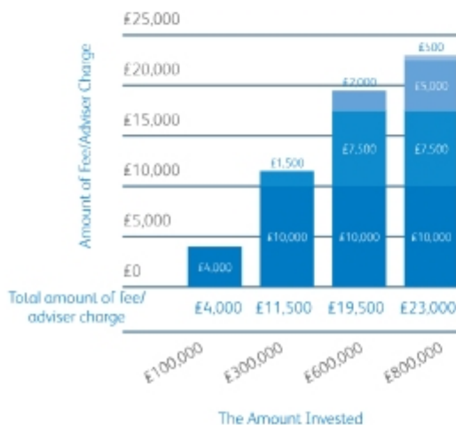
What you will pay based on an example of maximum fees for Advice and Implementation